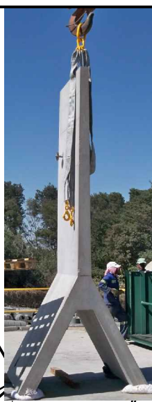
PLACING OPTION 1

4 LEG STRAPS WITH FORKLIFT OR CRANE (BY OTHERS) OR OTHER